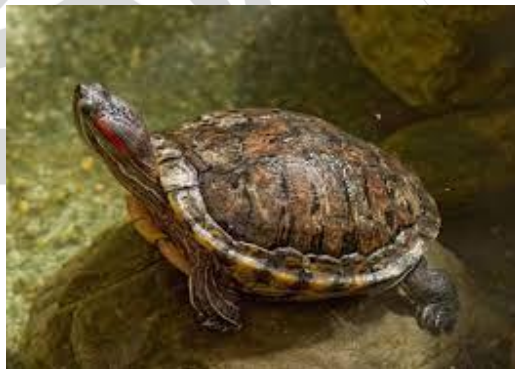
RED EAR SLIDER TURTLE