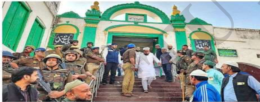
Under watch: Friday prayers happen under tight security at the Shahi Jama Masjid in Sambhal on Friday.