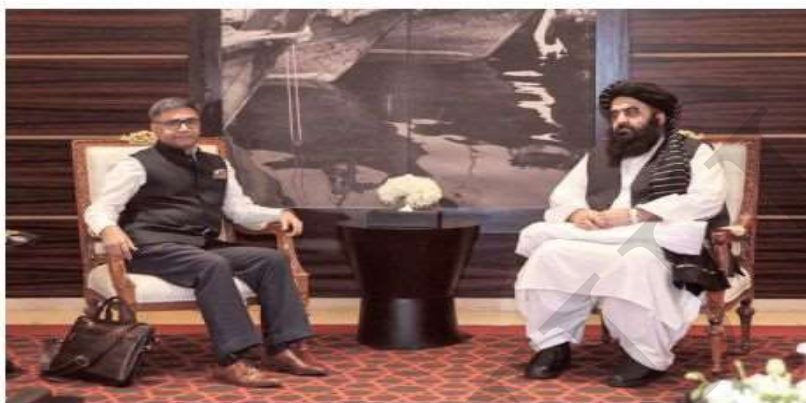
Foreign Secretary Vikram Misri meets Afghanistan Acting Foreign Minister Mawlawi Amir Khan Muttaqi in Dubai on Wednesday.