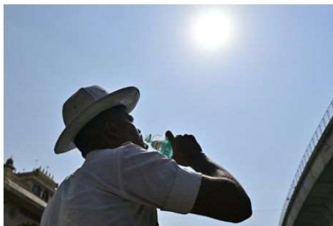
Scorching heat: Each of the past 10 years was one of the 10 warmest years on record. FILE PHOTO

The way climatological boundaries are determined, a single year in the red doesn't by itself spell catastrophe. Only when temperatures consistently