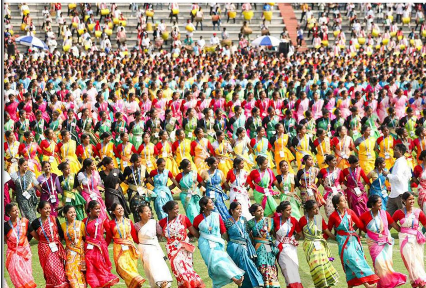
In sync: Artistes rehearsing for a mega Jhumoir Binandini dance event in Guwahati on Friday, in an attempt to set a world record.